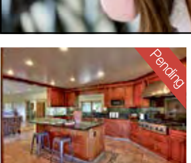
3/1.5 Lovely setting, 2222 sqft private w/ 6/4 Cool Contemporary in Glorietta. In-law 4/2 Light-filled home with flexible floor gardens, large flat patio, views, lrg high