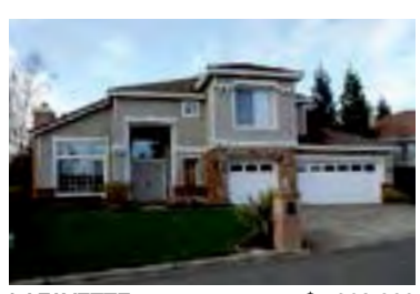
$1,369,000 4/3 Enjoy warmer days and longer nights w/this entertainer's dream Home with a Vlatka Bathgate CalBRE #01390784